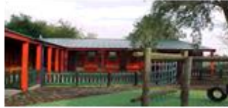
Monkchester Road Nursery