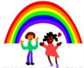
Newburn Manor Nursery School